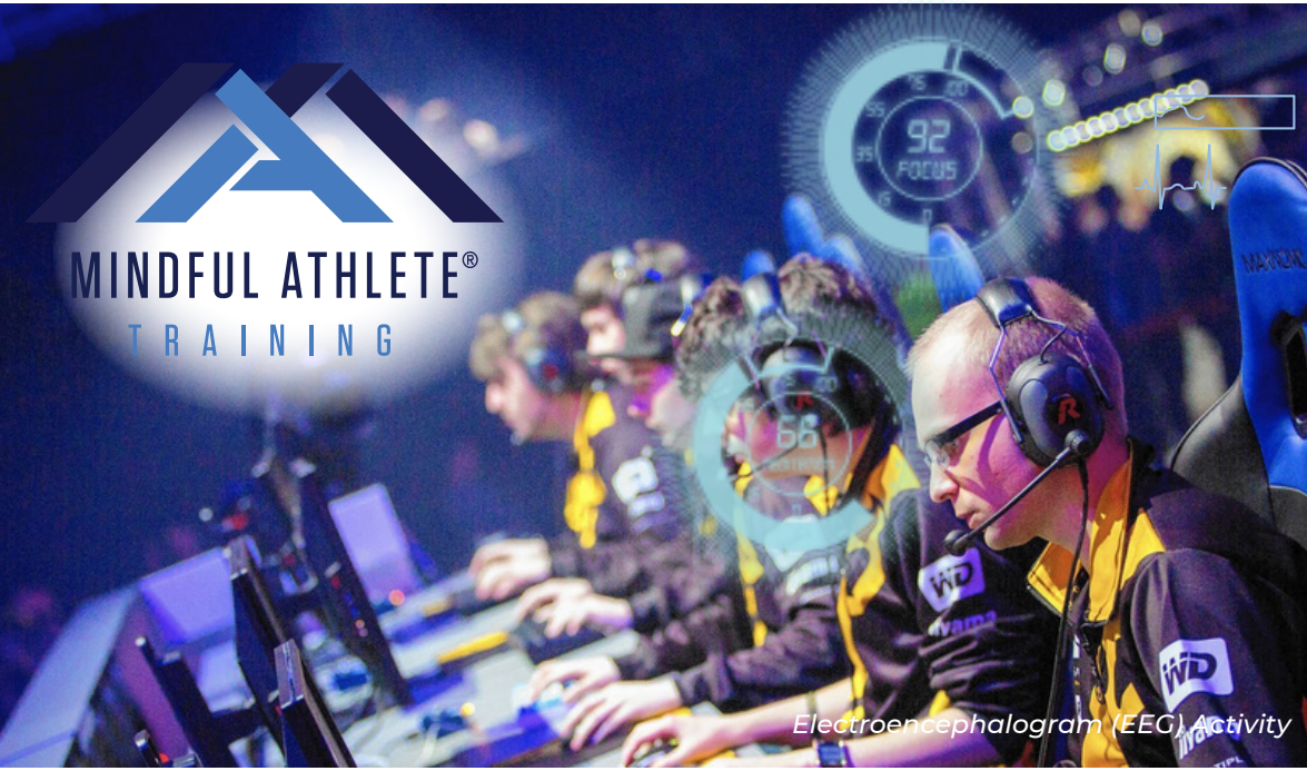
Electroencephalogram (EEG) Activity